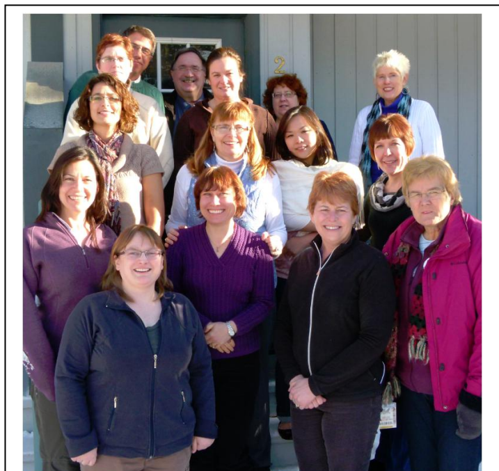
ALGEHR Board of Directors