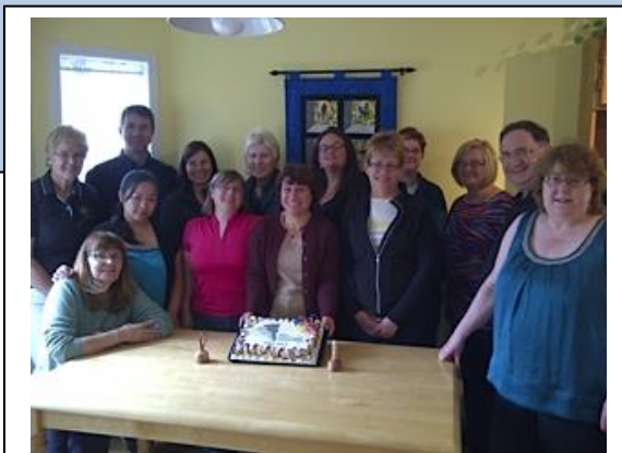
Celebrating 30 years: ALGEHR Current Board Members

Remember to register for ALGEHR'S annual