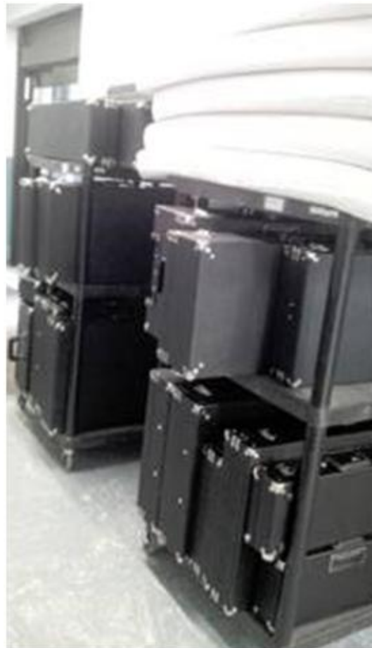
Transporting bells to the SWATCA session