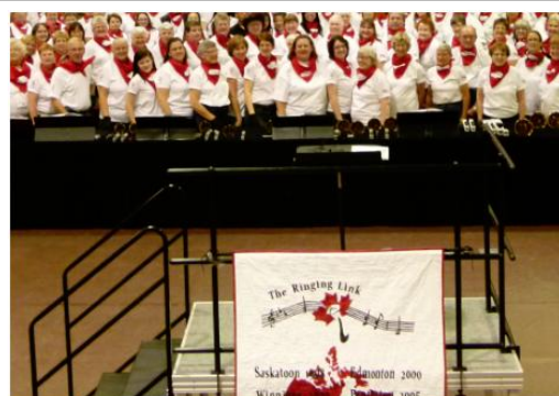
Conducting stand built for Ringing Link 2011

We need a home for our ALGEHR conducting platform. Do you, or does your school or church have a need for such a structure? Would you like to use it indefinitely until our next large handbell event? Or do you have some space to store this beautiful stand? (It does fold up!) For more info (size, height, transportation) email Ritu at: secretary@algehr.org