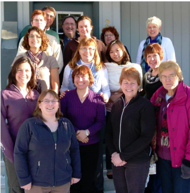
Your New ALGEHR Board of Directors.

Visit us at our ALGEHR Website: www.algehr.org