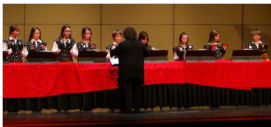
The Royal Ringers waiting to perform.