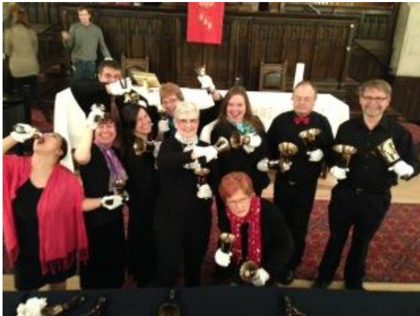
Life is good, the performance over! (Knox United Campanilla's)

If you are a history buff you will enjoy all things being planned to reflect the glorious age of the Victorian Era. Queen Victoria reigned from 1837-1901 and Charles Dickens wrote extensively throughout her reign. So what better place to have RL 2014 but at the VICTORIA INN!