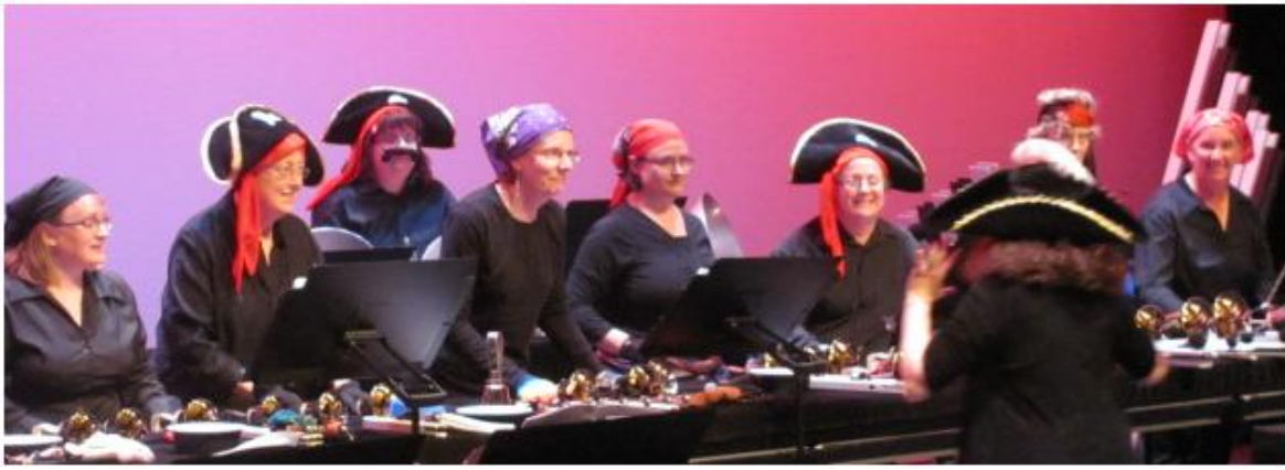
Jubiloso! performing the audience favourite: "Pirates of the Caribbean," at ALGEHR'S Discovery 2011 , in Fort McMurray.