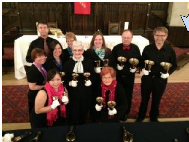
The Campanilla Handbell group of Knox United Church.