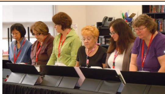
Concentrating attendees in the Fort McMurray Discovery 2011