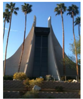
Palm Desert Community Presbyterian Church

I feel that I really only started to improve as a ringer once I began attending local, provincial and national seminars ( Handbell Discovery, Classic Bronze and Ringing Link ). We pick up big and little improvements when exposed to new directors, clinicians and other ringers, and I encourage all you ringers out there to take advantage of any new ringing opportunity that comes your way—be it for performance or skill enhancement. You will be stretched in ways you didn’t think possible. I am grateful for my own particular opportunity, and wish everyone who will be attending the International Handbell Symposium in Liverpool as fabulous a time as I had in the desert!